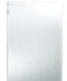
2 x Back Glass (400 x 815)