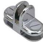
22 x 3Way Connectors