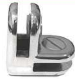
12 x 2Way Connectors