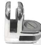
16 x 2Way Connectors