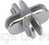
4 x 4Way Connectors