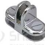
20 x 3Way Connectors